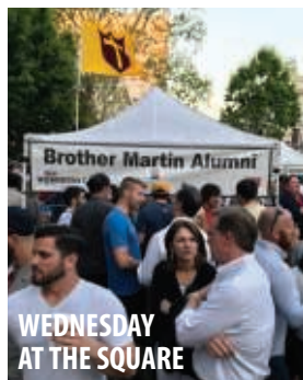
WEDNESDAY AT THE SQUARE

For additional information, contact the Advancement & Alumni Relations Office at 504-284-6700 or kspellman@brothermartin.com .