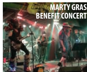
MARTY GRAS BENEFIT CONCERT